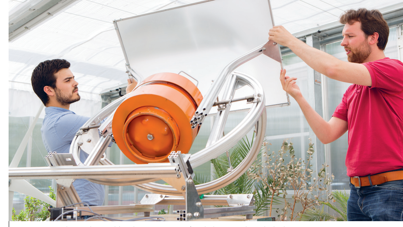
Students at the IDEE-lab at the HAN University of Applied Sciences, the Netherlands

The applied RDI agenda of UAS is not only determined by the world of work with the aim of meeting the needs of society and of the world of work.<sup>1</sup> It also